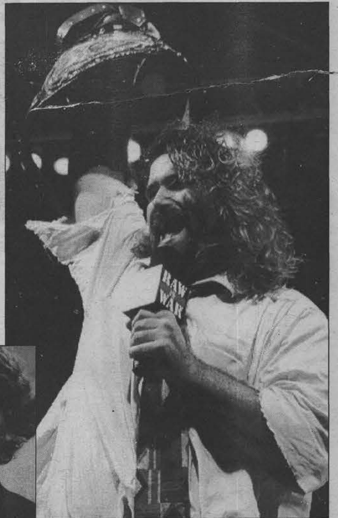
The faces of Mankind: As student at Ward Melville High School and WWF champ.